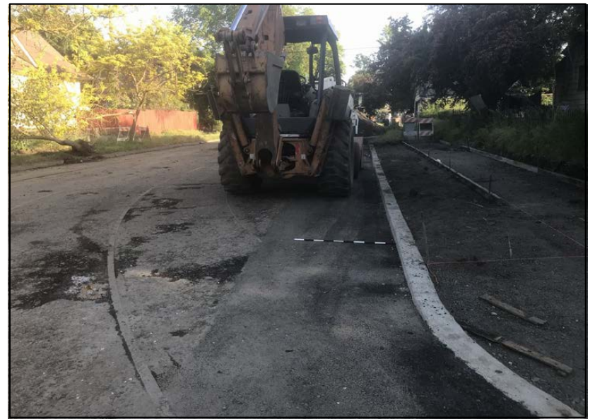
Counter Clockwise, Left to Right: Historic structure 45KI924, in WSDOT right of way for SR99 tunnel. Remnants of Smith Cove shantytown (45-KI-1200) discovered during Ecology CSO excavation, City of Spokane historic trolley tracks uncovered during stormwater project, intact foundation of historic home that survived the Great Ellensburg Fire of July 4, 1889, uncovered beneath parking lot in Ellensburg.