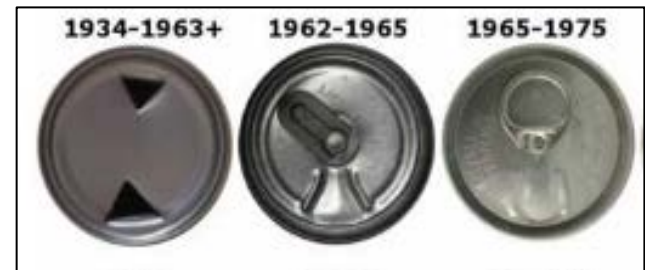
Can opening dates, courtesy of W.M. Schroeder.