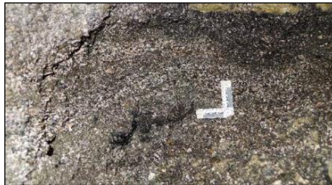
Shell midden with fire cracked rock.