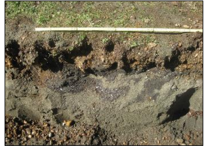
Shell Midden pocket in modern fill discovered in sewer trench.