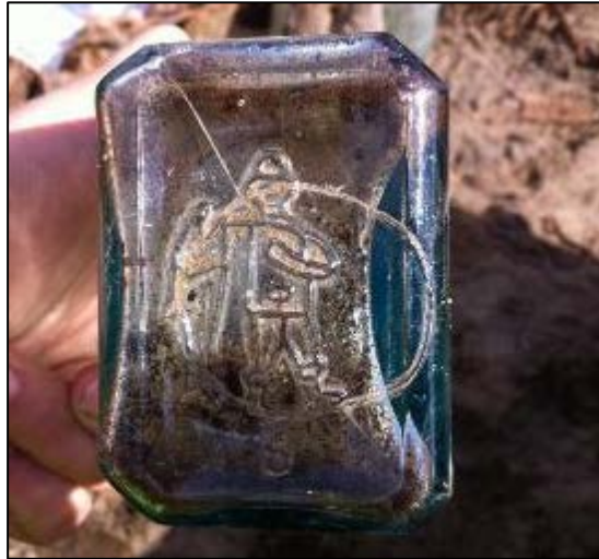
Far Left: .303 British cartridge found by a WCC planting crew on Skagit River. Don't ever touch something like this! Left: Maker's mark on bottom of old bottle.