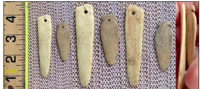
Above: Tooth Pendants. Right: Bone Pendants. Both from Oregon and Washington.