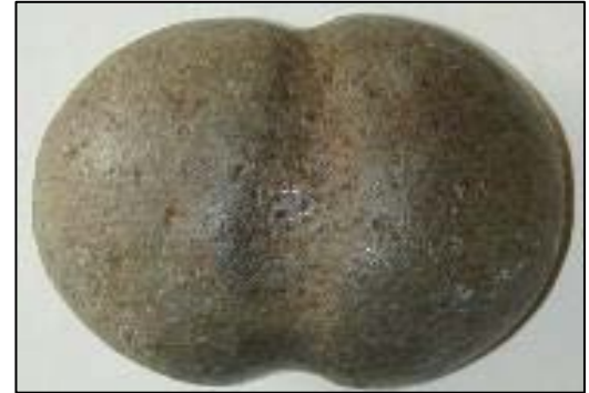
Above: Fishing Weight