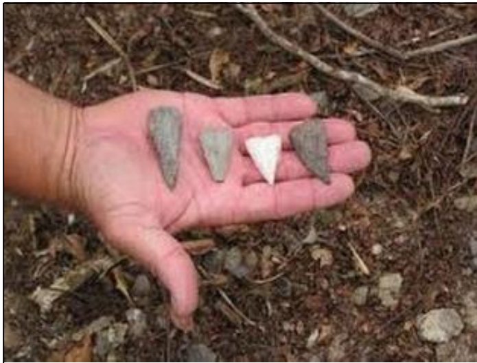
Stone artifacts from Washington.