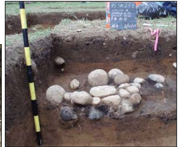
Hearth excavated near Hamilton, WA.