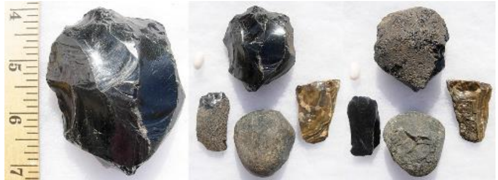
Stone artifacts from Oregon.