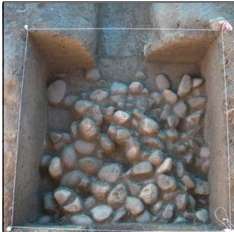
Underground oven.