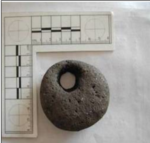
Artifacts from unknown locations (left and right images).