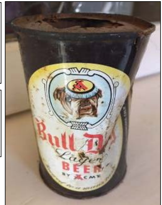
Right: Old beer can found in Oregon. ACME was owned by Olympia Brewery.