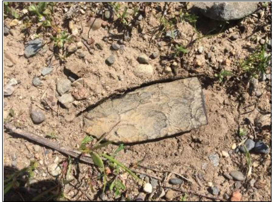
Biface-knife, scraper, or pre-form found in NE Washington. Thought to be a well knapped object of great antiquity.