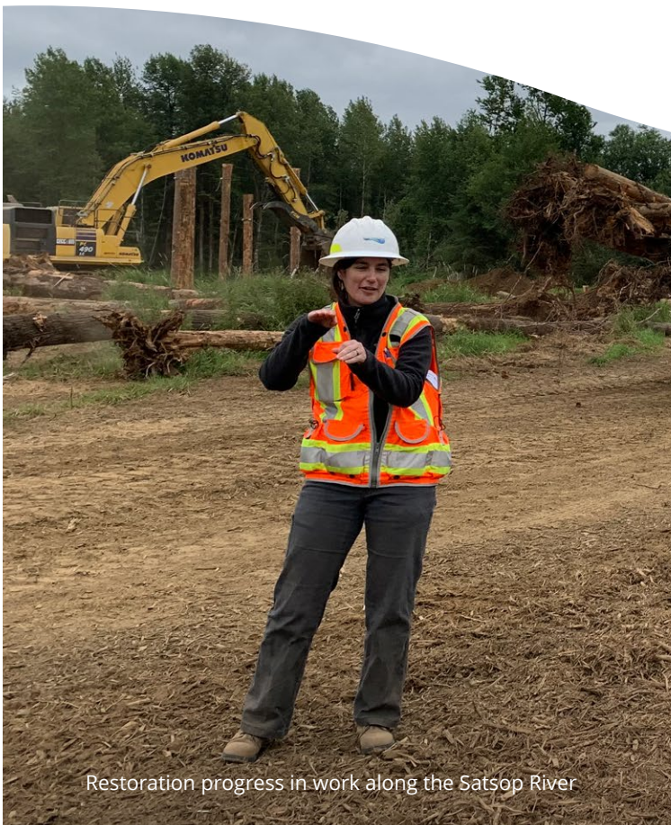
Restoration progress in work along the Satsop River