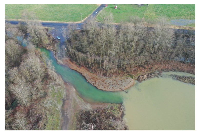
Figure 4. January 2021 drone flight showing Phase 2 restoration activities to enhance hydraulic connection and overflow channel into Pond C fully engaged.