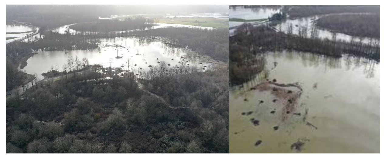
Figure 3. Drone flight of January 2021 high water event. All ponds are connected to the river.

Winter 2020-2021 was the first high flow season after all completed restoration actions across the pond complex. The restoration site is fully functioning to absorb flood waters from the Satsop River for storage after our rip rap, dike, and spoils pile removals and active channel reengagement ( Figure 3, Figure 4 ). Enhancing a connection from the upper end of Pond C was not part of our restoration plans but, because the river independently re-engaged, we decided to actively contribute to this ongoing process.