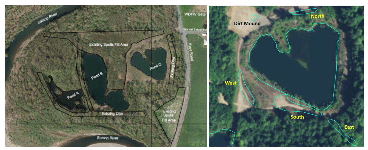
Figure 1 . Satsop Ponds Pre-Restoration Footprint (left). Lines approximate positions of ponds, dikes, and spoils areas. Temporary (Auxiliary) Ponds (right) associated with permanent Pond C at the Satsop Restoration Sites

To support this effort, we began monitoring this site including its seasonal ponds in March 2015. Monitoring from 2015-2019 documented baseline conditions at the ponds prior to restoration. In 2019 & 2020, post-restoration monitoring began and will be completed in 2023.