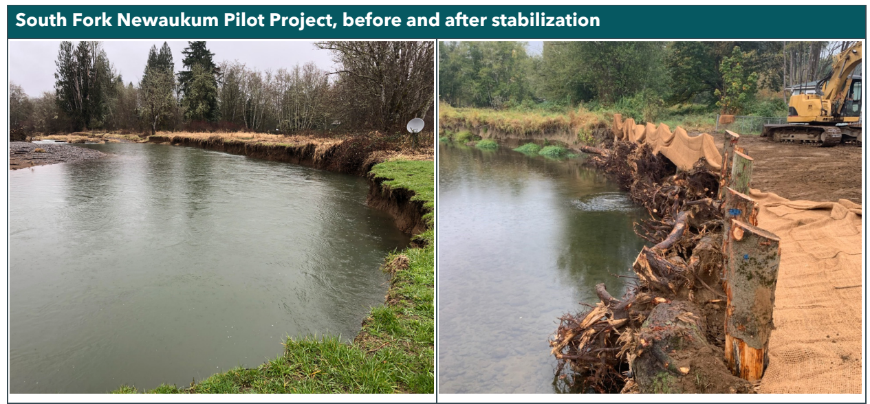
Note: Photographs courtesy of B. Amrine at Lewis Conservation District

South Fork Newaukum: A private residence with bank erosion along the right bank of the South Fork Newaukum River occurring within 20 feet of the house. Sediment deposition on the left bank gravel bar across the river has been substantial in the winter of 2021/2022. The erosion program funding provided for design in summer/fall of 2022, and the Chehalis Basin Board subsequently provided direct funding for construction, which was completed in fall 2022.