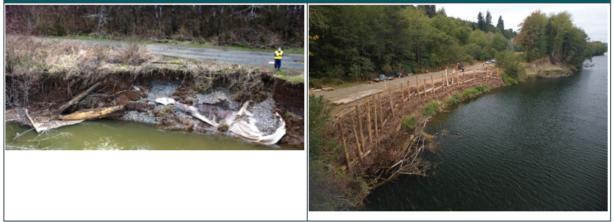
Note: Photographs courtesy of Port of Grays Harbor